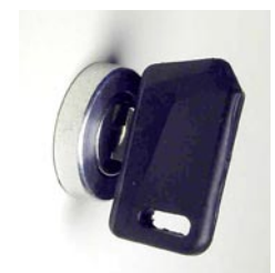
Key Switch System